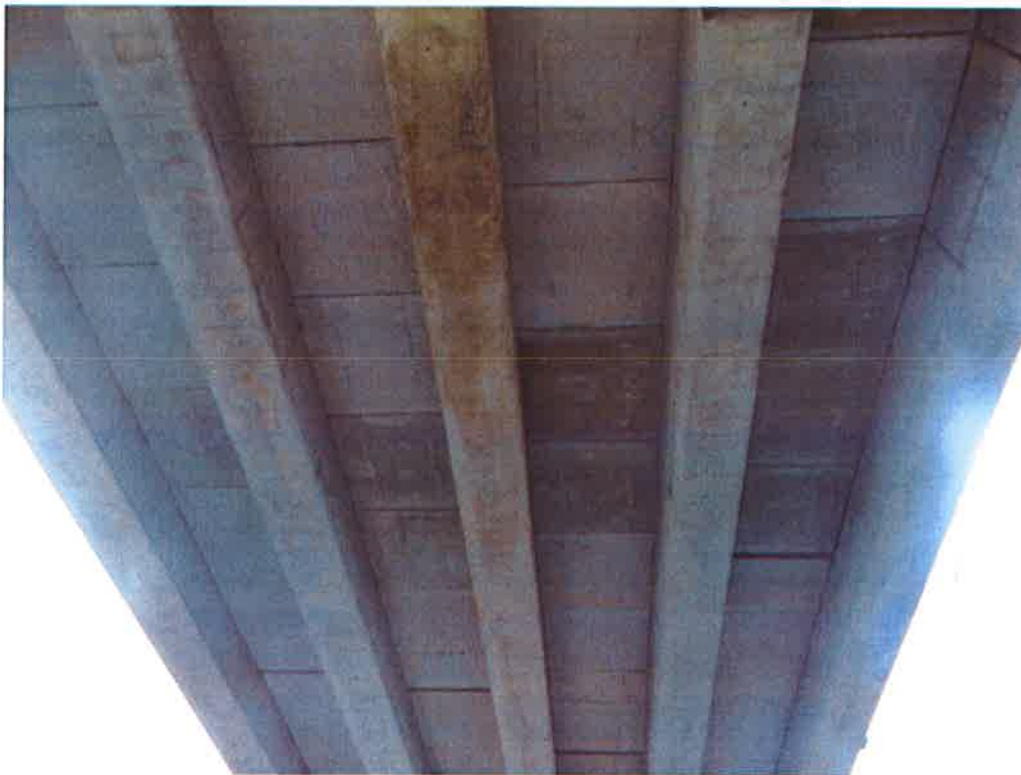
Pic. #1 Underside View; Bridge No. 19-I440-0.36R