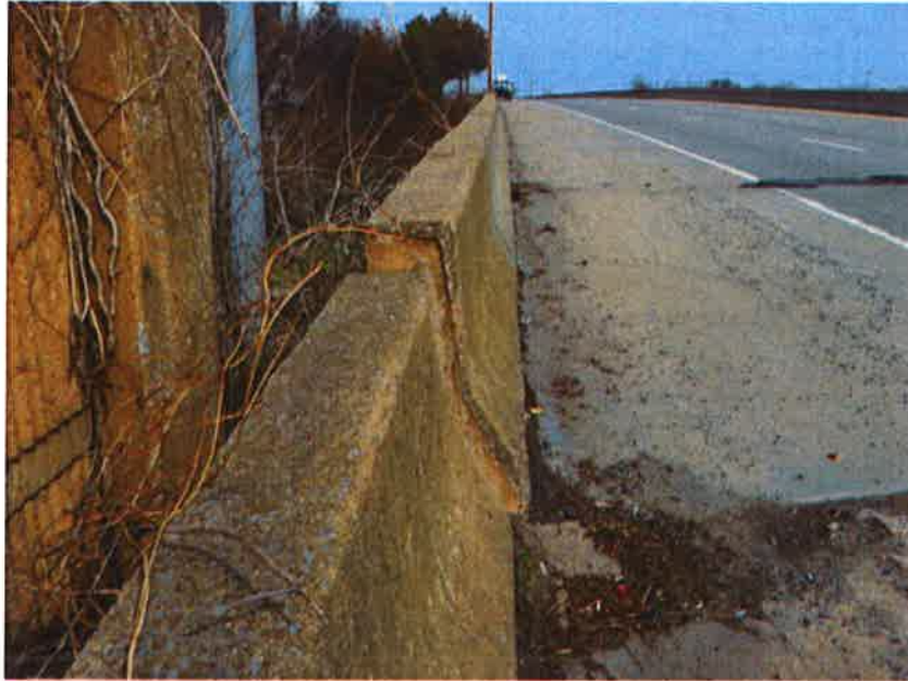
BRIDGE PARAPET "B" END RT. MISALIGNED