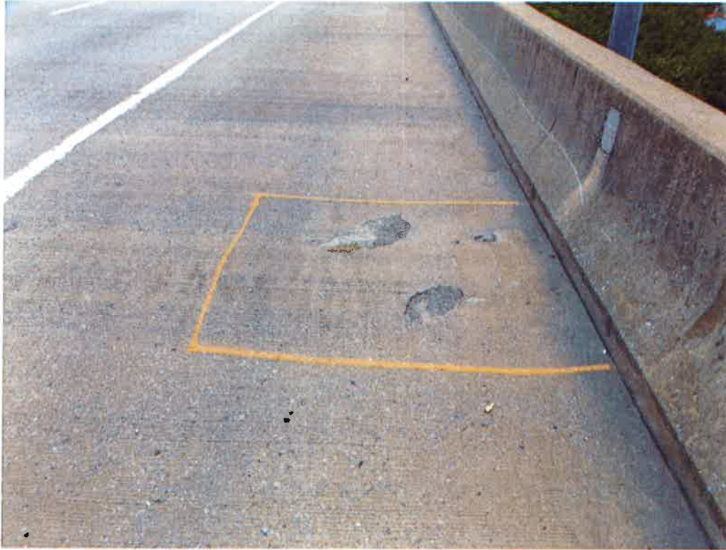
Pic #27, Partial On Right Shoulder