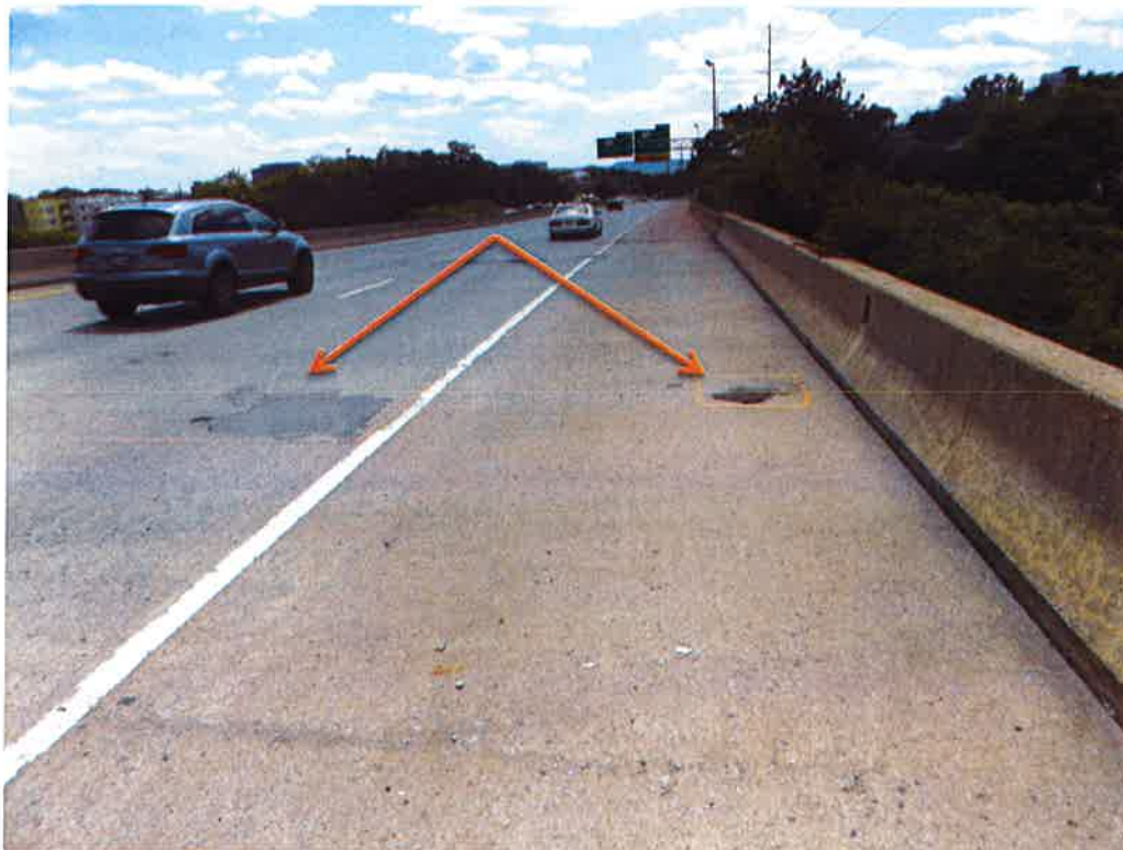
Pic #28, Partial, Asphalt Patches; Bridge No. 19-I440-0.36R