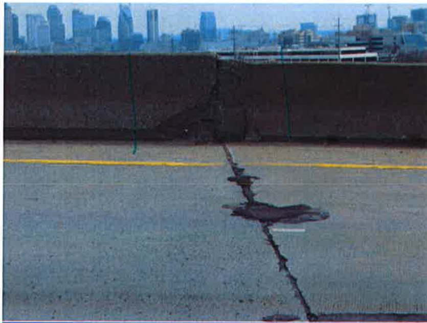
BRIDGE PARAPET "B" END LT. IMPACT DAMAGE