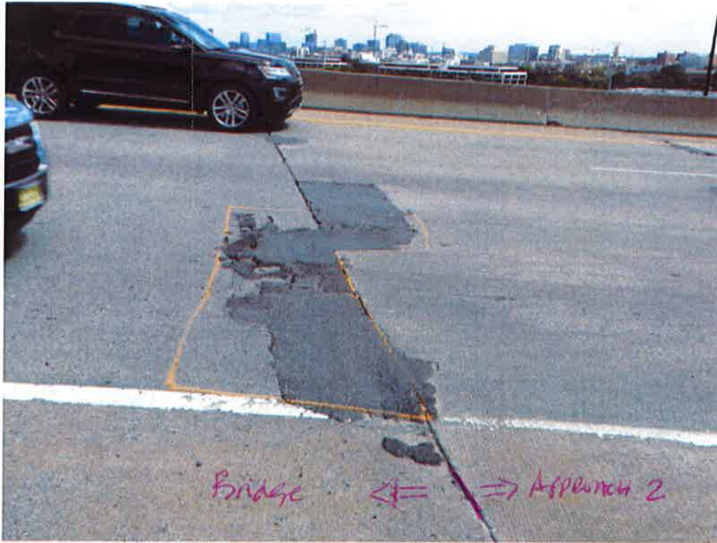
Pic # 29 Patches along Joint 2 @ Abut. #2